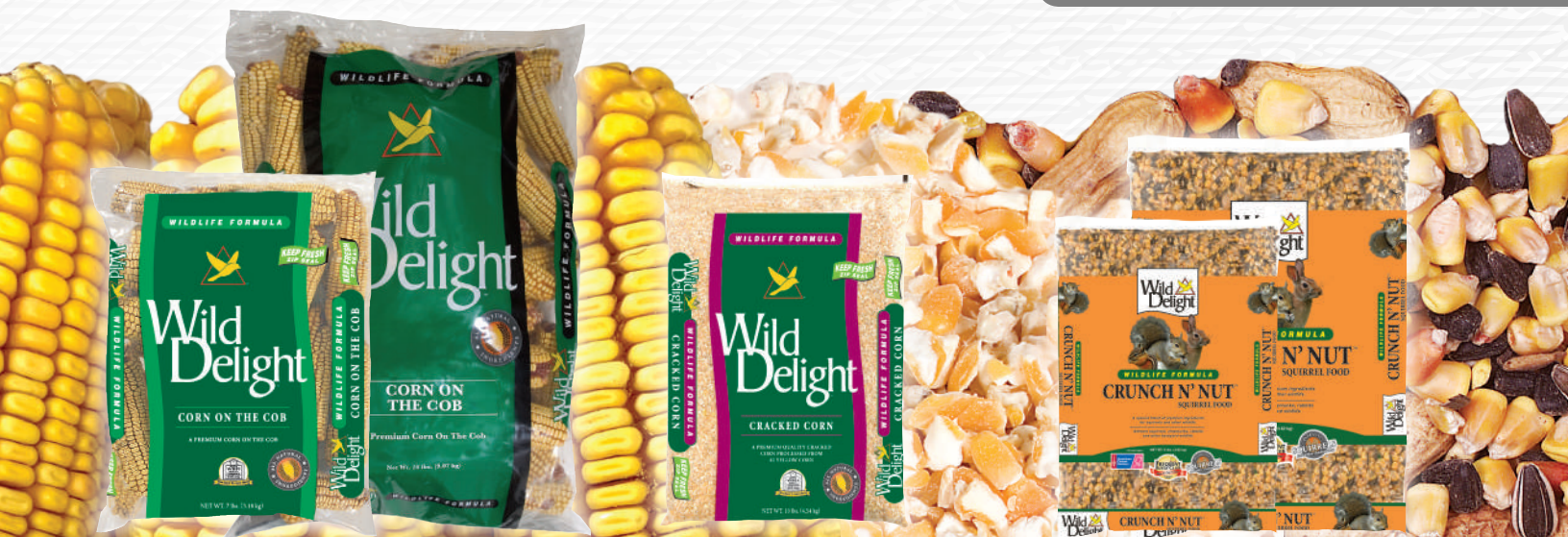
Corn On The Cob