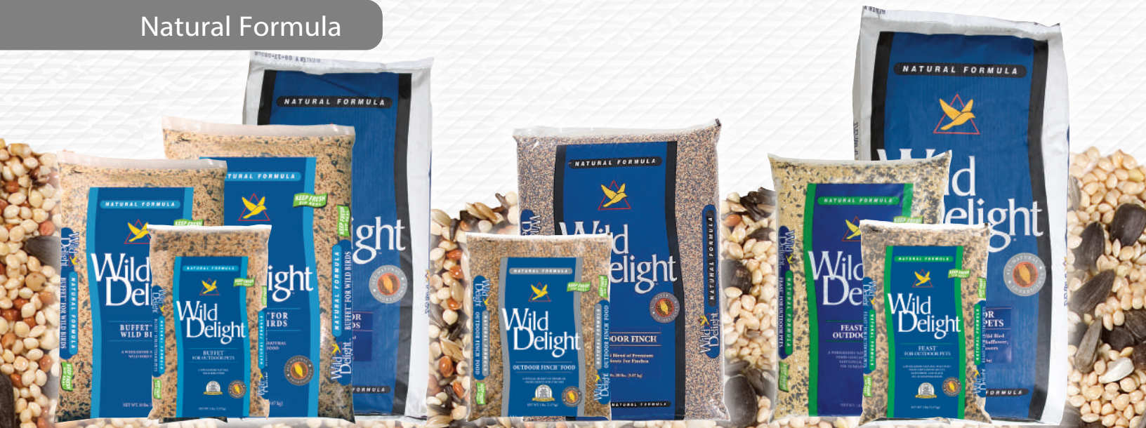
Buffet® For Outdoor Pets