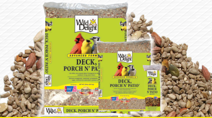
Deck, Porch N' Patio®