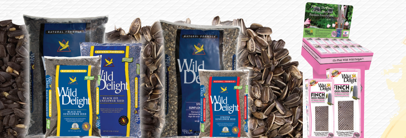
Black Oil Sunflower Seed