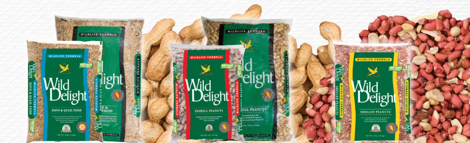
Dove & Quail Food