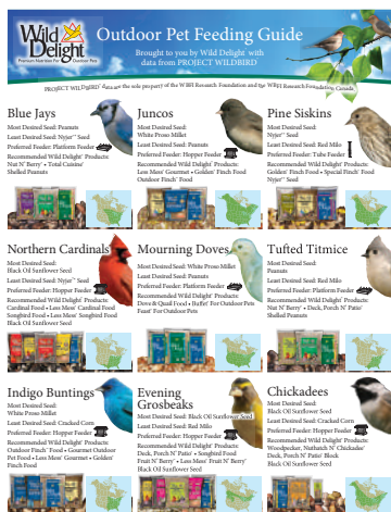
PWDBR0380 Laminated Feeding Chart

Hang with provided chain to shelf in prominent area of Wild Delight® section.