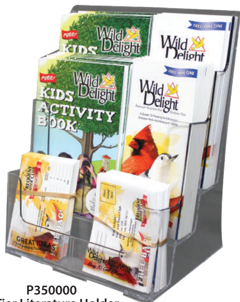
P350000 3-Tier Literature Holder

Please display holder with kids activity books, consumer guides, and Frequent Buyer Club envelopes on shelf in prominent area of Wild Delight® section. Please see image for illustration. Holders are securely fastened together with connectors (included).