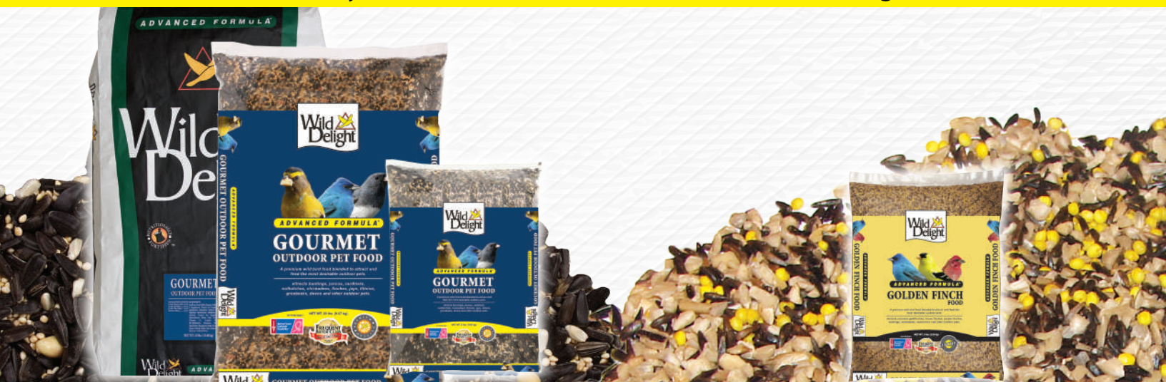
Gourmet Outdoor Pet Food