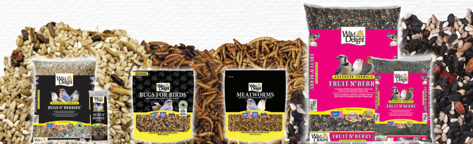
Bugs N' Berries®