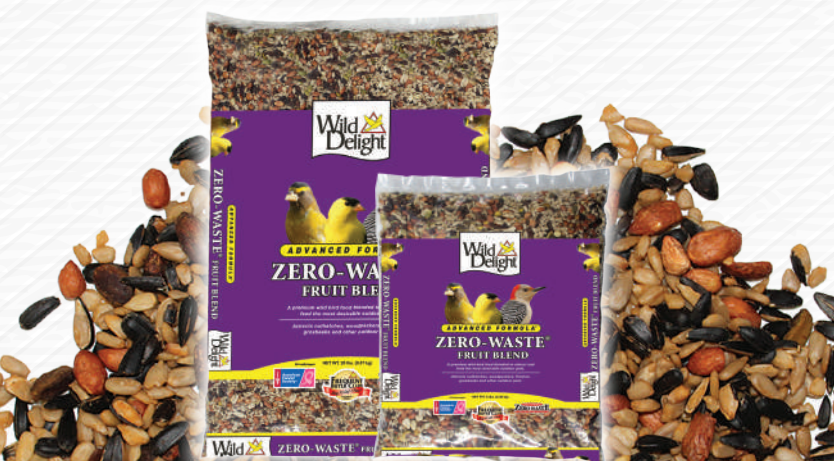
Zero-Waste® Fruit Blend