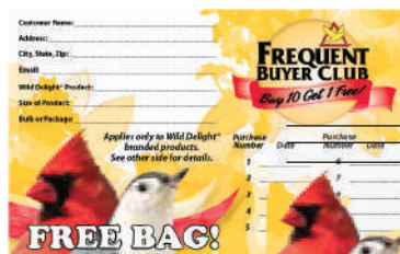
PWD6000 Frequent Buyer Club Envelope