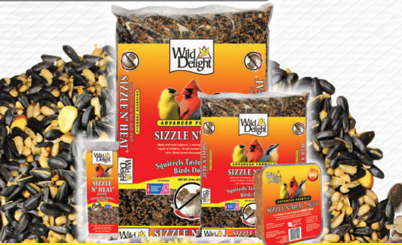
Sizzle N' Heat®