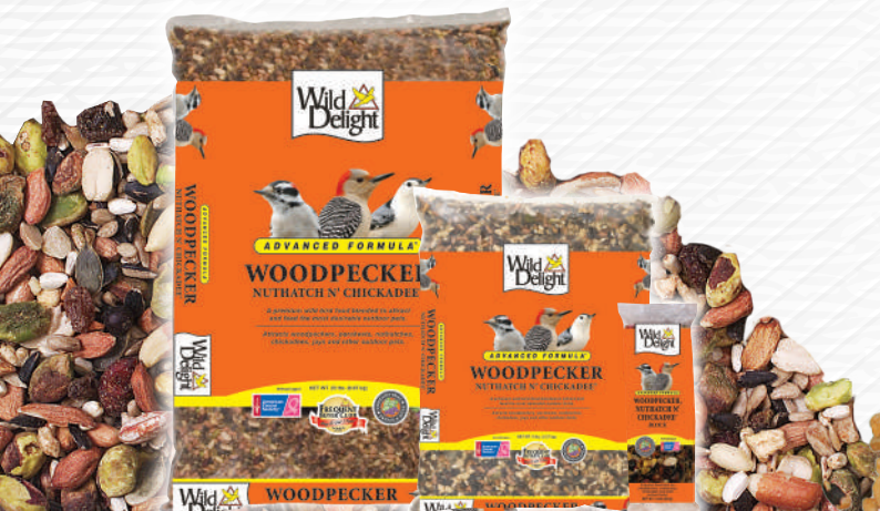
Woodpecker, Nuthatch N' Chickadee®