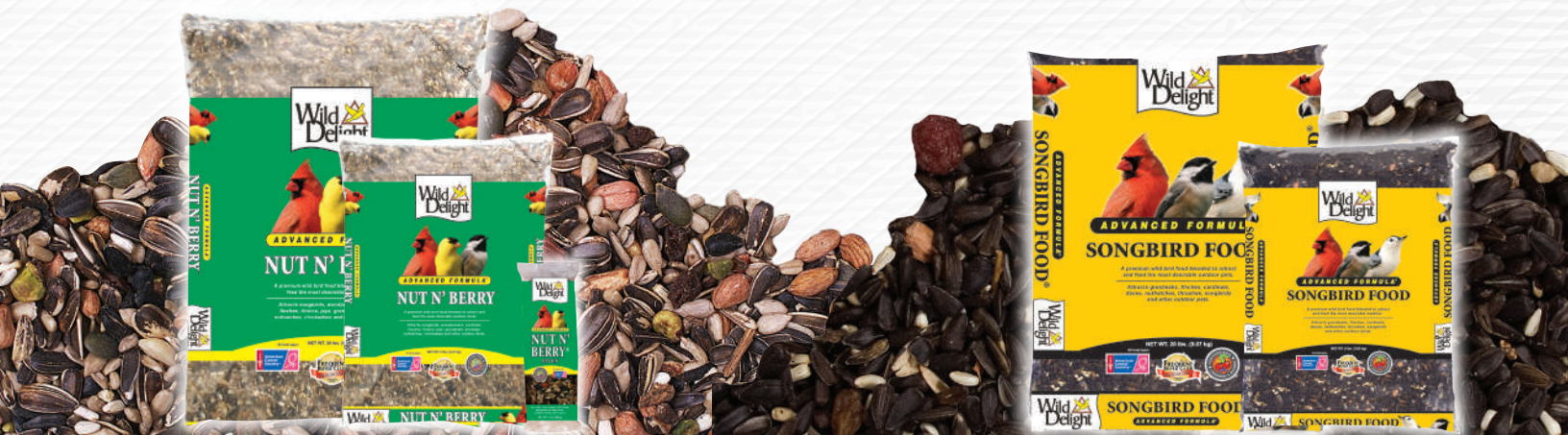
Nut N' Berry®