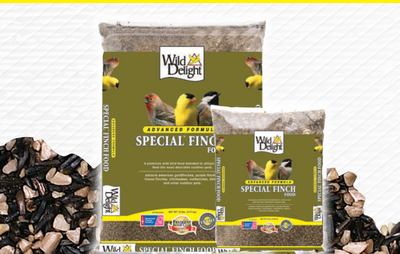
Special Finch® Food