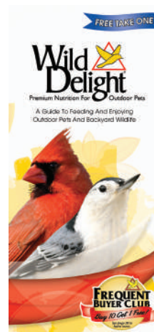
PWDMC0500 Consumer Guide