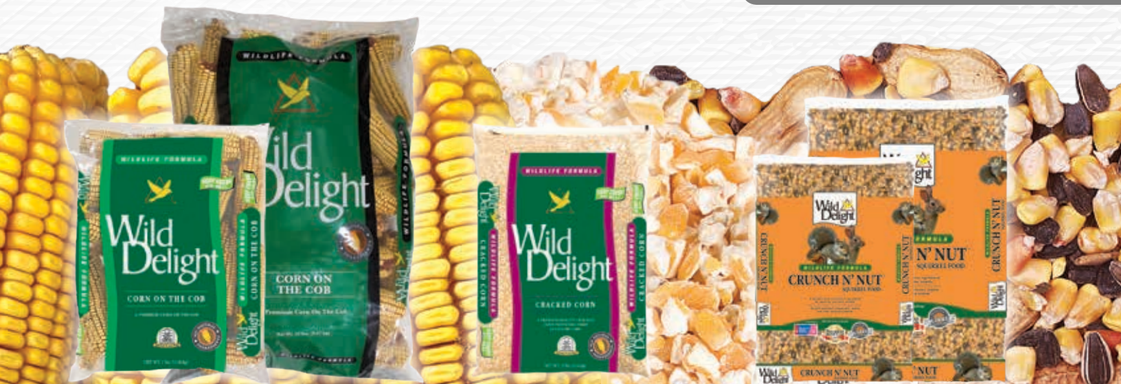
Corn On The Cob