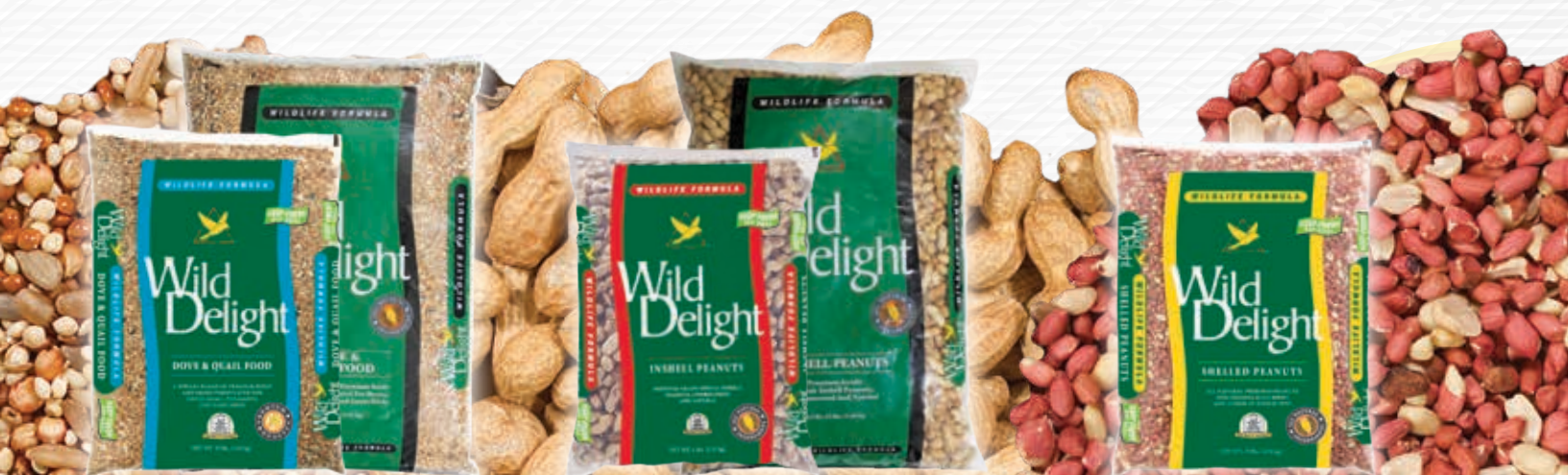
Dove & Quail Food