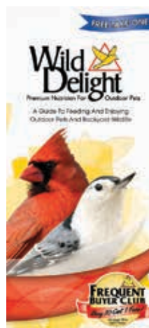
PWDMC0500 Consumer Guide