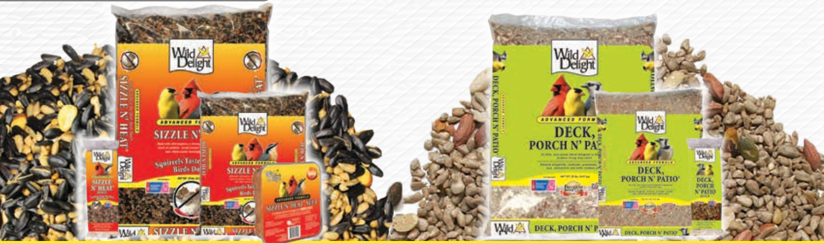
Sizzle N' Heat®