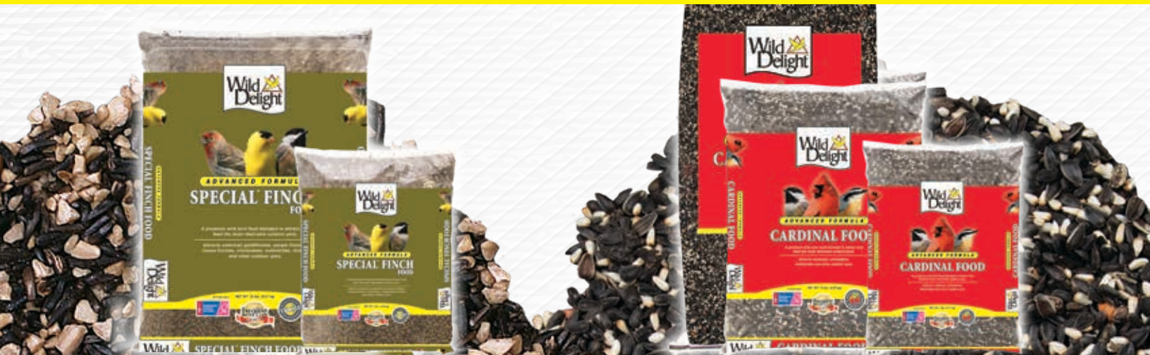
Special Finch® Food