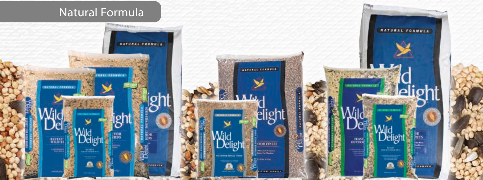
Buffet® For Outdoor Pets