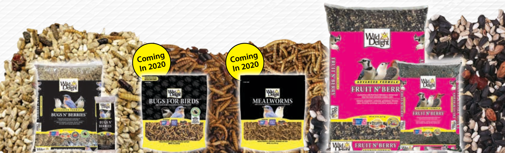
Bugs N' Berries®