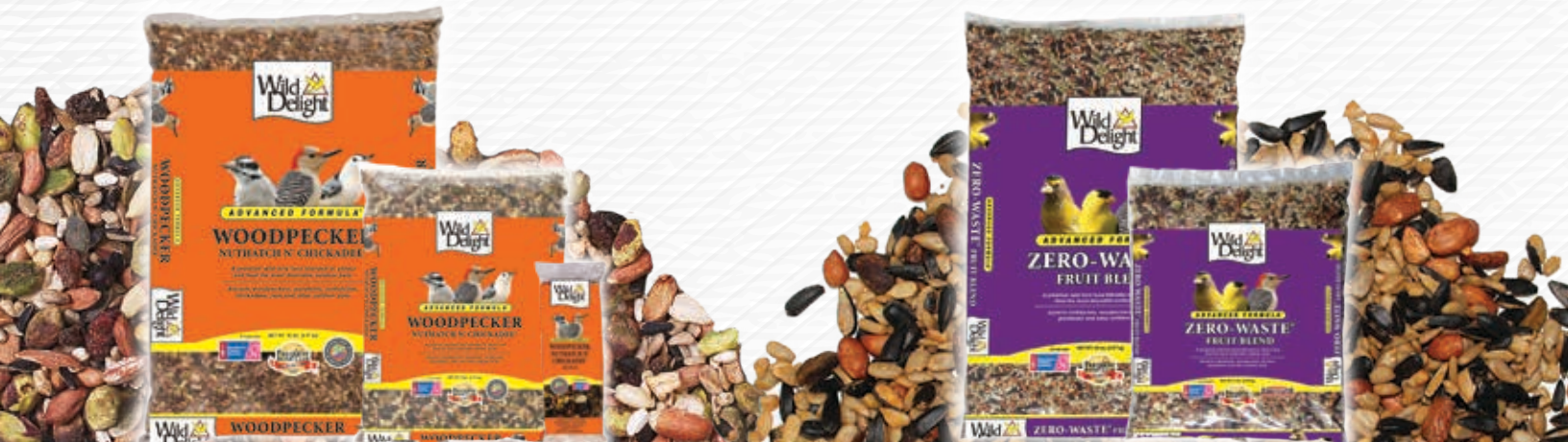
Woodpecker, Nuthatch N' Chickadee®