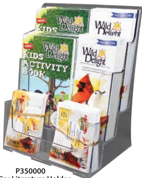
P350000 3-Tier Literature Holder

Please display holder with kids activity books, consumer guides, and Frequent Buyer Club envelopes on shelf in prominent area of Wild Delight® section. Please see image for illustration. Holders are securely fastened together with connectors (included).