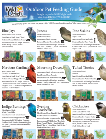
PWDBR0380 Laminated Feeding Chart

Hang with provided chain to shelf in prominent area of Wild Delight® section.