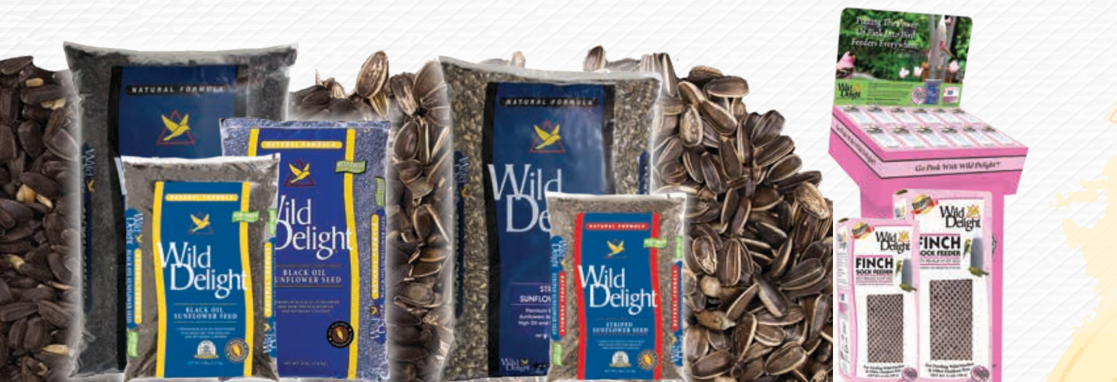
Black Oil Sunflower Seed