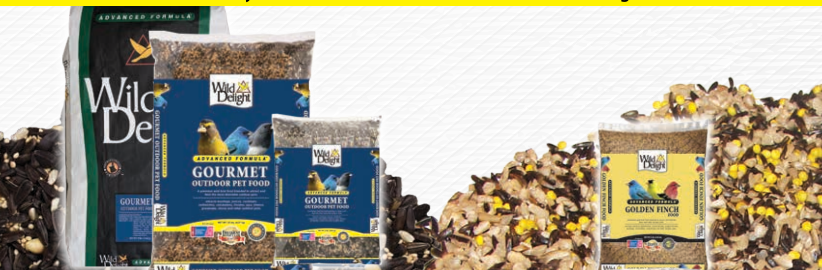
Gourmet Outdoor Pet Food