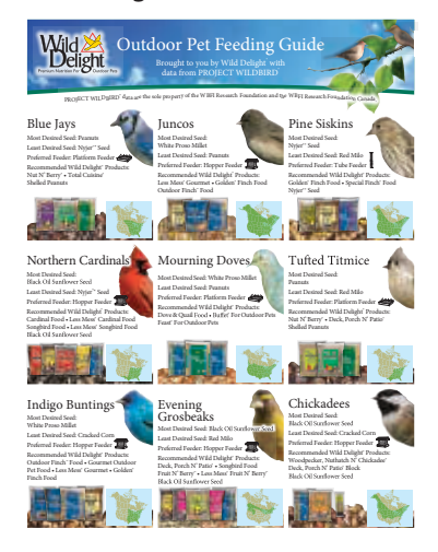
PWDBR0380 Laminated Feeding Chart

Hang with provided chain to shelf in prominent area of Wild Delight® section.